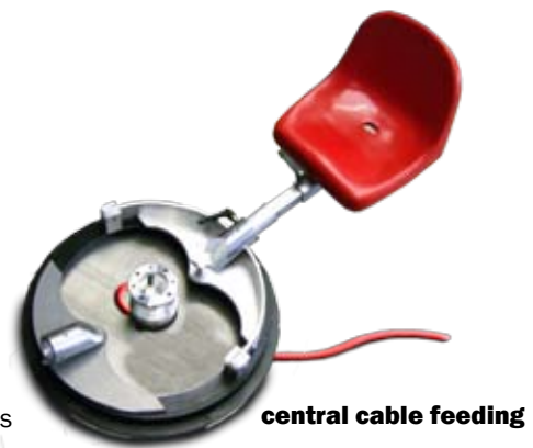
central cable feeding

At soccer matches it can be used at all camera positions close to the pitch. At tennis broadcasts it comes in handy if positioned close to the net and at athletics it is often used at the end of jump discipline areas. The Orbiter 750 provides a range 360° for the operator in a low sitting working position and it allows trouble-free movement due to its central cable feeding. It allows independent movement of camera and seat. Horizontal pan and movement of the seat are not linked but on the same axis. Steady pictures are achieved by the Orbiter's patented design. Contrary to other low shooters the seat is not directly connected to the camera column. This means no shock motions are transmitted from the operator to the camera.